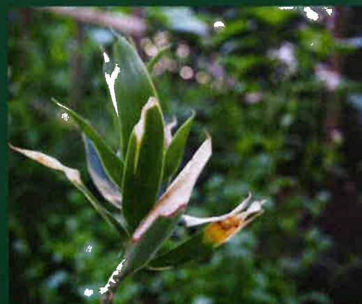
GARDEN PHOTOS TAKEN BY JONATHAN GORE