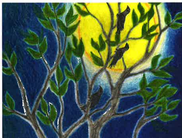
Drawing by Eletha Shackelford